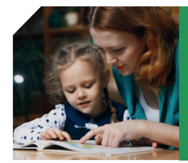
Learning support Costs for extra-curricular learning support can be covered. Please note: You must first file a separate application.