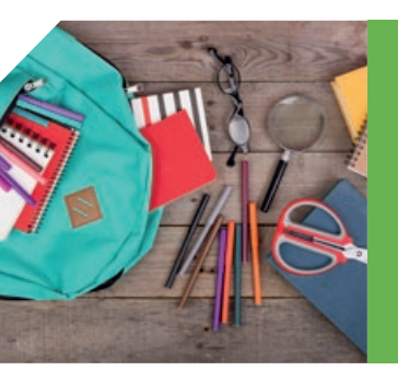
School supplies 150 € per school year shall be granted. 100 € at the start of the school year, followed by 50 € at the start of the second