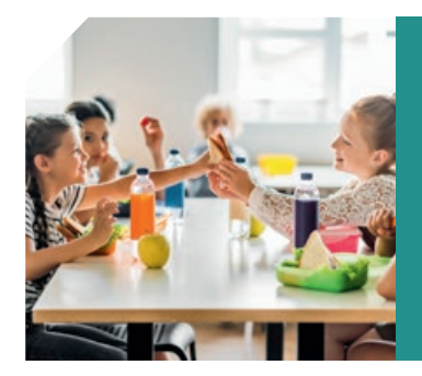
Lunch School or kindergarten lunch fees shall be covered.